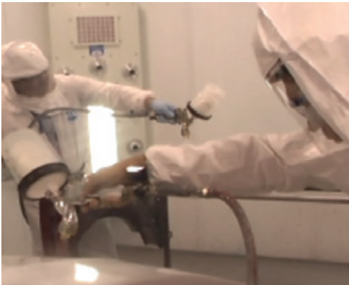
Improved viscosity to flow and lay optimally.