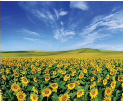
MAP Ultra Low VOC has lower VOC levels than even some water-based paints.