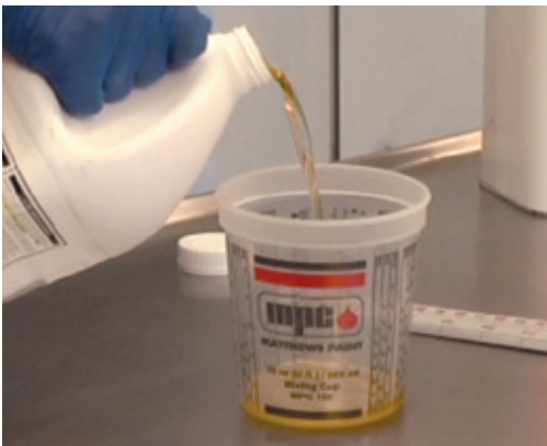
MAP Ultra Low VOC mix ratio is similar to the MAP Conventional topcoats.