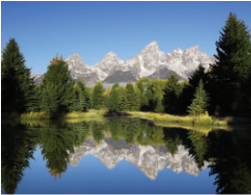
MAP Ultra Low VOC has less impact on the environment while providing superior performance.