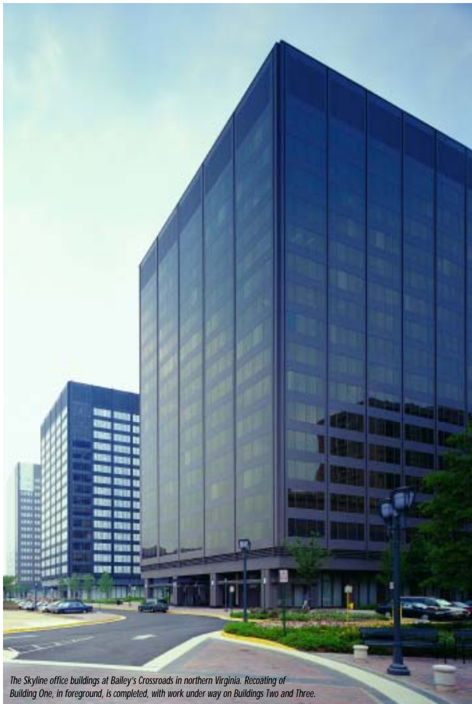
The Skyline office buildings at Bailey's Crossroads in northern Virginia. Recoating of Building One, in foreground, is completed, with work under way on Buildings Two and Three.

each of the three structures, which combined consisted of 450,000 square feet of surface to be coated.