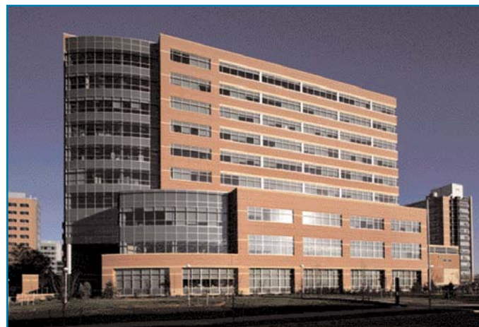
The Leprino Office Building at the University of Colorado Hospital is glazed with Solarban 70XL glass by PPG.

Owner: University of Colorado Hospital (UCH) Architect: Davis Partnership Architects, Denver, CO Glass Fabricator: Northwestern Industries, Inc., Seattle, WA Glazing Contractor: A-1 Glass, Inc., Denver, CO PPG IdeaScapes Products: Solarban ® 70XL Glass