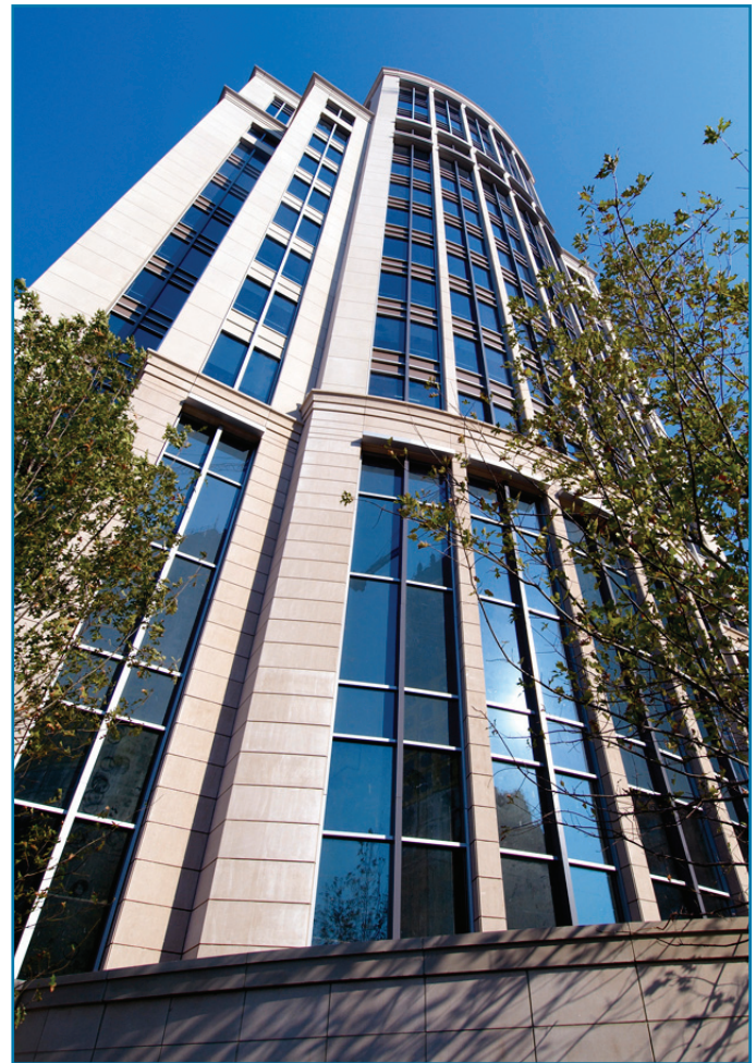
A fretwork of Solarban ® z50 glass, framed by Indiana limestone, highlights the façade of Rosewood Court in Dallas' prestigious Uptown neighborhood.

Even more importantly, thanks to its good looks and prestigious location, Rosewood Court is filling up fast. “We’ve gotten rave reviews from our clients,” Horsak adds. “The building is already 70 percent leased with less than a full year on the market.”