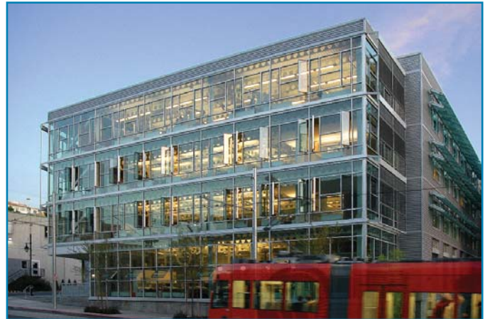
New Solarban 72 Starphire glass is comparable to Solarban 70XL glass, pictured here on AIA COTE award winner, The Terry Thomas in Seattle, with significantly better visible light transmittance and similar solar control.

PPG IdeaScapes™ Integrated products, people and services to inspire your design and color vision.